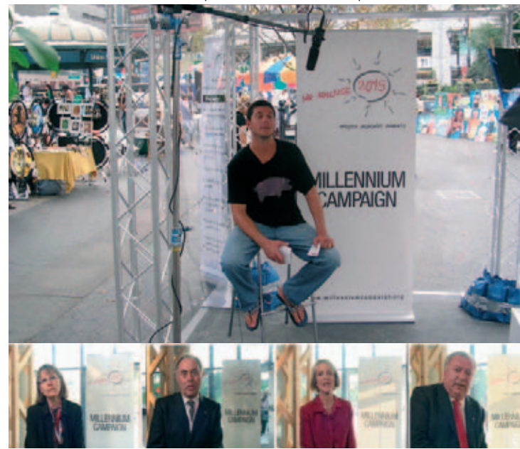
During the 23rd General Assembly of the Council of European Municipalities and Regions – in Innsbruck, Austria in May 2006 – more than 40 mayors had the opportunity to record a message in support of the Millennium Development Goals. The voices of mayors were recorded in a specially-designed "Voices Against Poverty" box.

In September 2005, the UN Millennium Campaign installed a mobile recording studio in a central location in New York City. This recording studio – the "Voices Box" – recorded messages against poverty by ordinary New Yorkers of all walks of life. These voices were later broadcast on local TV stations to increase awareness about development and the Millennium Development Goals.